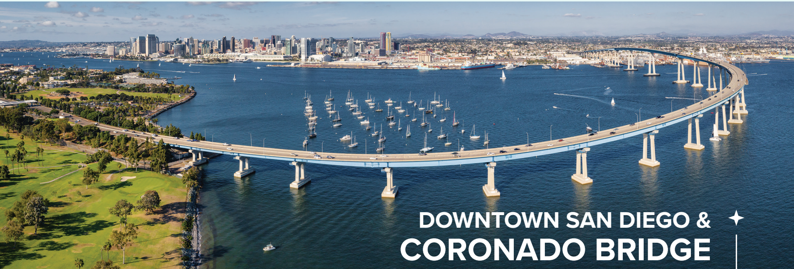
DOWNTOWN SAN DIEGO & CORONADO BRIDGE